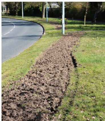
Wildflower strip preparation

The Parish Council has always aimed to keep Astley village looking as attractive as possible, so we are keen to develop wildflower areas along Chancery Road. We are pleased to report that Chorley Borough are planting strips of wildflowers running from Long Copse to Long Croft Meadow as well as an area at the junction of The Farthings and Chancery Road. You may remember that the latter was planted