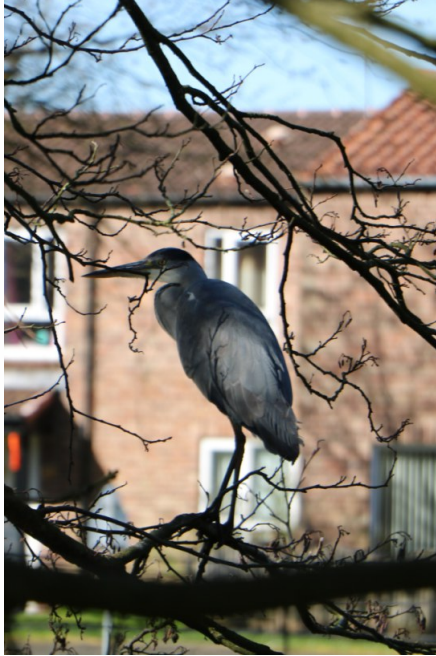
Heron perched in a tree next to Buckshaw Pond