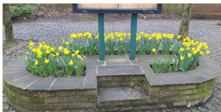
Stone Planter on Hallgate

There are ten planters along Chancery Road which the Parish Council have had installed over a number of years. We continue to maintain and upgrade these and we thank those residents who help to keep them looking good. At the time of writing the bulbs are fading and we shall be planting some summer colour soon. You will have noticed that the Parish Council have had the bus shelters along Chancery Road power cleaned, including the paved areas around them.