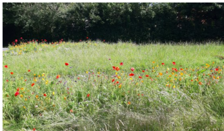
Wildflower area planted last year

The Parish Council has always aimed to keep Astley village looking as attractive as possible, so we are keen to develop wildflower areas along Chancery Road. We are pleased to report that Chorley Borough are planting strips of wildflowers running from Long Copse to Long Croft Meadow as well as an area at the junction of The Farthings and Chancery Road. You may remember that the latter was planted