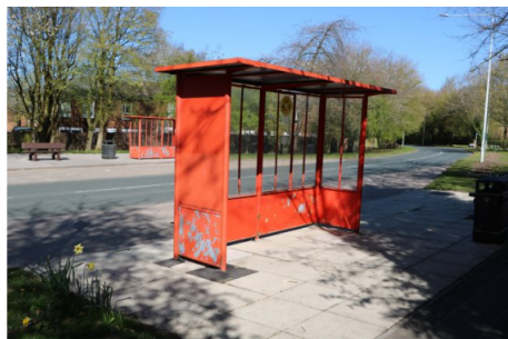
Newly cleaned bus shelter and paved area

This is now showing the poor condition of the paintwork and following discussions with Chorley Borough Council it has been agreed to jointly fund the re-painting of the shelters.